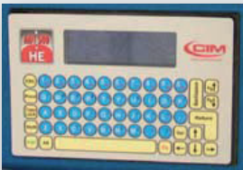
Integrated standard keyboard