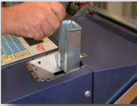
Interchangeable input hoppers for dog tags and medical alert tags for easy change