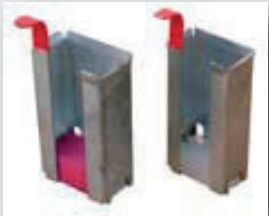
Medical alert tags & dog tags