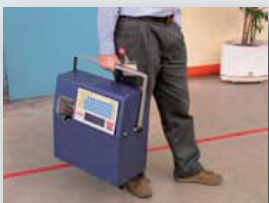
Easy to carry handle